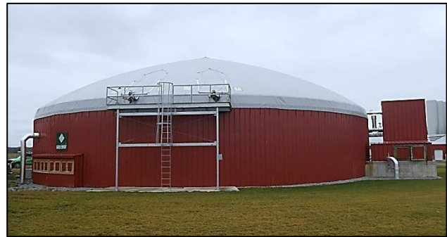
Anaerobic digester at Noblehurst Farms.