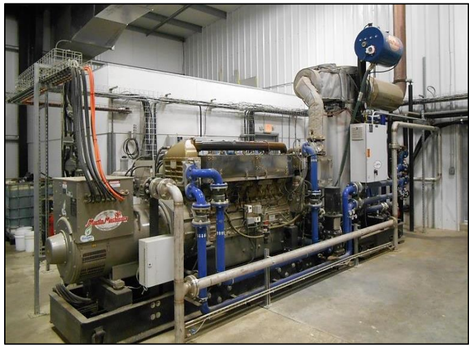
Figure 3. Guascor HGH system.

Hydrogen sulfide scrubbing takes place within the digester vessel gas headspace; ambient air is injected into the digester headspace to achieve an O 2 concentration of 0.5-0.6% facilitating microbial oxidation and hydrogen sulfide abatement. Desulfurized biogas is passively dried as it cools in below-grade plumbing used to transport the biogas to the engine room. The slope of the plumbing allows condensate to be collected in a sump. The biogas is combusted in a Guascor HGH 240 engine equipped with a Martin Machinery 500 kW generator (Figure 3.). The system is operated between 440 and 450 kW. Electricity is net-metered and used to power the farm, AD system, mixing and control rooms, and the Craigs Station Creamery milk plant. Recovered heat is used to heat the digester, the mixing and control rooms. A hot water line is run to the adjacent milk processing plant for future use. With minimal maintenance and utility disruption the system has to date experienced a 98.6% uptime, resulting in a capacity factor of 0.89.