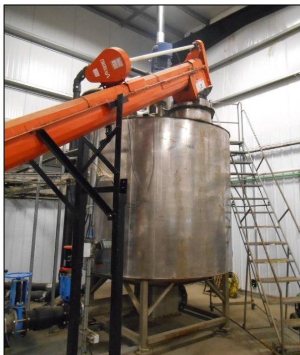
Figure 2. EnviTec automated mixing system

The system was designed to handle 425,000 lbs. of influent per day. Noblehurst Farms maintains the digester at approximately 1,080,000 gal. and co-digests an influent consisting of 65% manure (~ 40,000 gal. per day) and 35% pre/post-consumer food and milk plant wastes. The digester is operated at ~103°F with a biogas headspace pressure of 0.0555 psi and a ~21 day retention time.