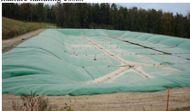
Impermeable cover installed on an existing earthen dairy manure storage in New York State

Rainwater can be isolated from the manure storage with an impermeable cover. The benefit to excluding rainwater is realized in the reduced cost of land application, increased storage capacity of the manure storage system or reduction of the required storage size. The total impact of rainwater avoidance depends upon the surface area of the storage system, whether adjacent areas contribute runoff to the storage, and the net annual precipitation (rainfall-evaporation) of the specific site. Annual avoidance can range from 300,000-700,000 gallons per acre of surface area in NY. The accompanying Cover Cost Calculator allows for the estimation of on-farm savings based on rainwater avoidance and specific manure handling costs.