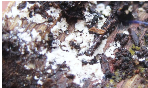
Figure 2. Biofilms on wood chip media [2] .

The first step to pollutant removal is physical and chemical capture (‘sorption’) of the contaminants by the media, free surface water, and/or directly by surface attached microbial growths (‘biofilms’, Figure 2.). For soluble contaminants (e.g. ammonia) capture can happen quite rapidly, for less soluble contaminants (e.g. methane) capture can be rate limiting and longer residence times may be required.