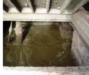
Confined space in a manure reception pit