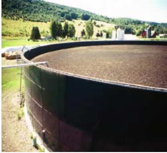
Upright manure storage tank