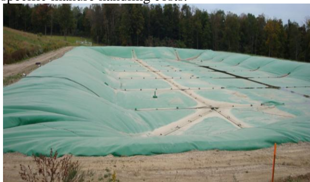
Impermeable cover installed on an existing earthen dairy manure storage in New York State

Rainwater can be isolated from the manure storage with an impermeable cover. The benefit to excluding rainwater is realized in the reduced cost during land application, the increased storage capacity of the manure storage system or the reduction of the required storage size. The total impact of rainwater avoidance depends upon the surface area of the storage system, whether adjacent areas contribute runoff to the storage, and the net annual precipitation (rainfall-evaporation) of the specific site. Annual avoidance can range from 300,000-700,000 gallons per acre of surface area in NY. The accompanying Cover Cost Calculator allows for the estimation of on-farm savings based on rainwater avoidance and specific manure handling costs.