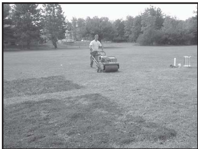
Compost is applied to turf plots in a park to determine the most beneficial application rate.