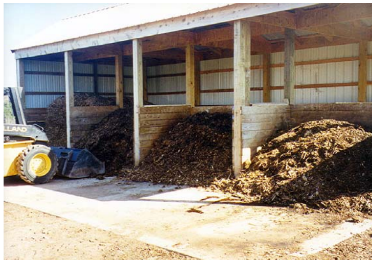
Large multi-bin system.

If using one bucket for multiple operations, it is important to turn compost from oldest to youngest and not load finished compost with a pathogen-contaminated bucket. Finished compost can be contaminated with pathogens from materials that have not been fully composted.