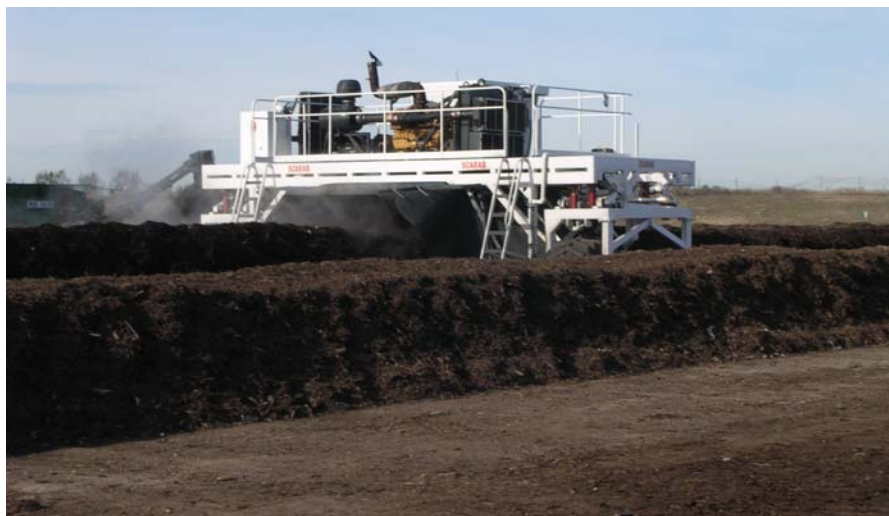
Self-propelled straddle turner.

Self-propelled Straddle Turners – These turners are generally for large facilities with five or more acres of windrows to turn. They can turn piles from 5 feet to 7 feet tall, and their larger size and horsepower allows them to turn windrows more quickly. A rotating drum shaft combined with hammers or flails reduces the size of the material and aerates and mixes the windrow. Drums on some turners can be moved vertically, which allows the operator to control the distance between the bottom of the turner and the pad surface. This is especially effective when turning dense feed stock, or incorporating additional bulking material that is laid as a base prior to pile construction.