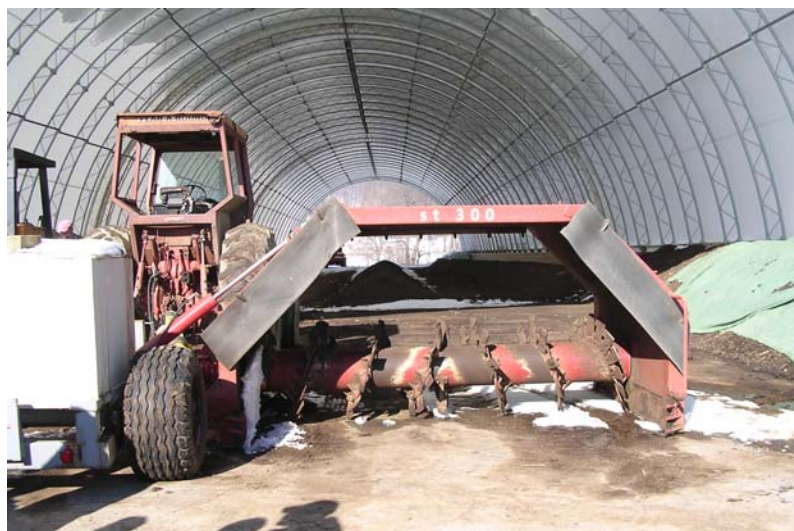
Tow-behind PTO-powered turner.

Windrow Turners – Windrow turners are dedicated pieces of equipment that just turn compost windrows. The right turner will mix, reduce particle size, homogenize the organic material and may save time and space. Turners come in many sizes and the choice depends on the amount of use, climatic fluctuations (in cold climates a bigger turner may be needed to achieve adequate pile size), and a dedicated person available for composting. Most turner