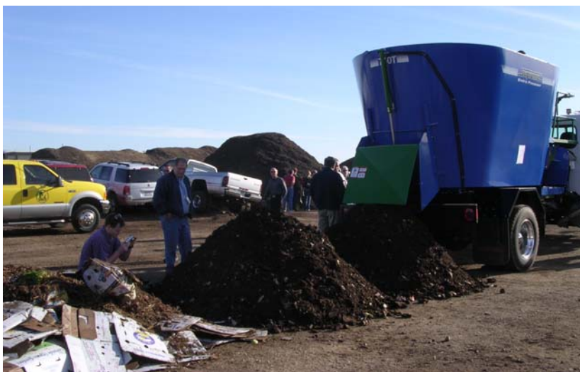
A mixer grinding cardboard and organics.

Grinding Buckets – Some loader buckets have grinding mechanisms in the bucket.