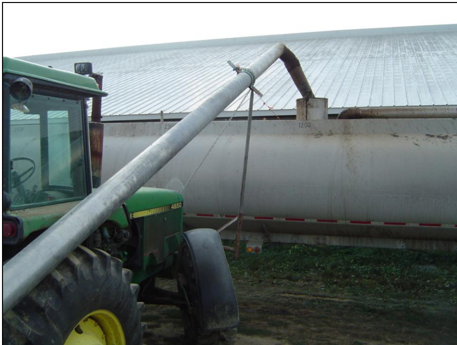
Figure 2. Pump test setup at SK

For the hydraulic piston pumps, found on four of the farms, the pump effluent stream (AD influent) was diverted to fill an 8,000 gallon manure tanker (typically used as a nurse tank during manure spreading operations) as shown in Figure 1. Concurrently, the number of pump strokes was counted.