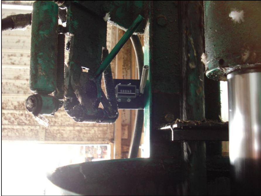
Figure 3. Installed stroke counter on a piston pump

All centrifugal pumps have been outfitted with time clocks (Redington Model 722-0004), connected to the motor starter as shown in Figure 4 to measure the pump run-time of the pump feeding the AD. This number is recorded daily by the farms on project prepared log sheets and also bi-weekly during scheduled site visits.