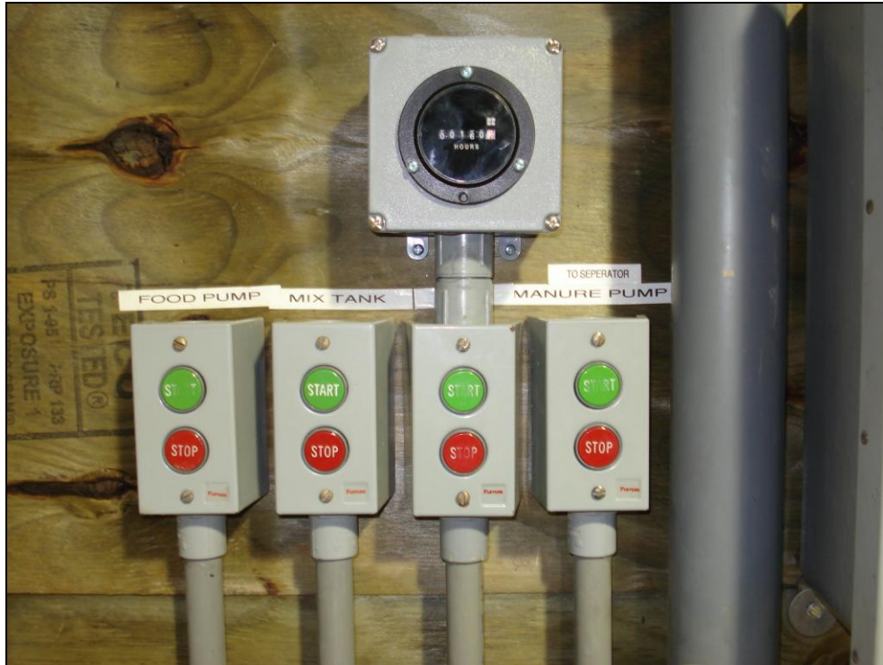
Figure 4. Time clock installed on a motor starter of a centrifugal pump