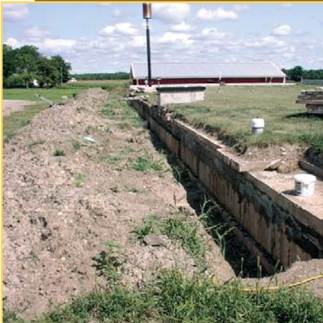
Hard-top digesters can be hard to seal

“Our hope is that this digester will pay for itself and help us maintain good relations with our neighbors”