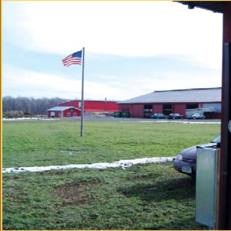
Extra electric is sold off site

Noblehurst Dairy, York, Livingston County