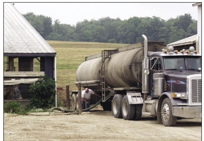
Food waste being pumped into the reception pit of an anaerobic digester at Matlink Dairy Farm, Clymer, Chautauqua County, N.Y.

Animal manure and food wastes have the potential to be converted into useful bioenergy. It's estimated that a methane yield